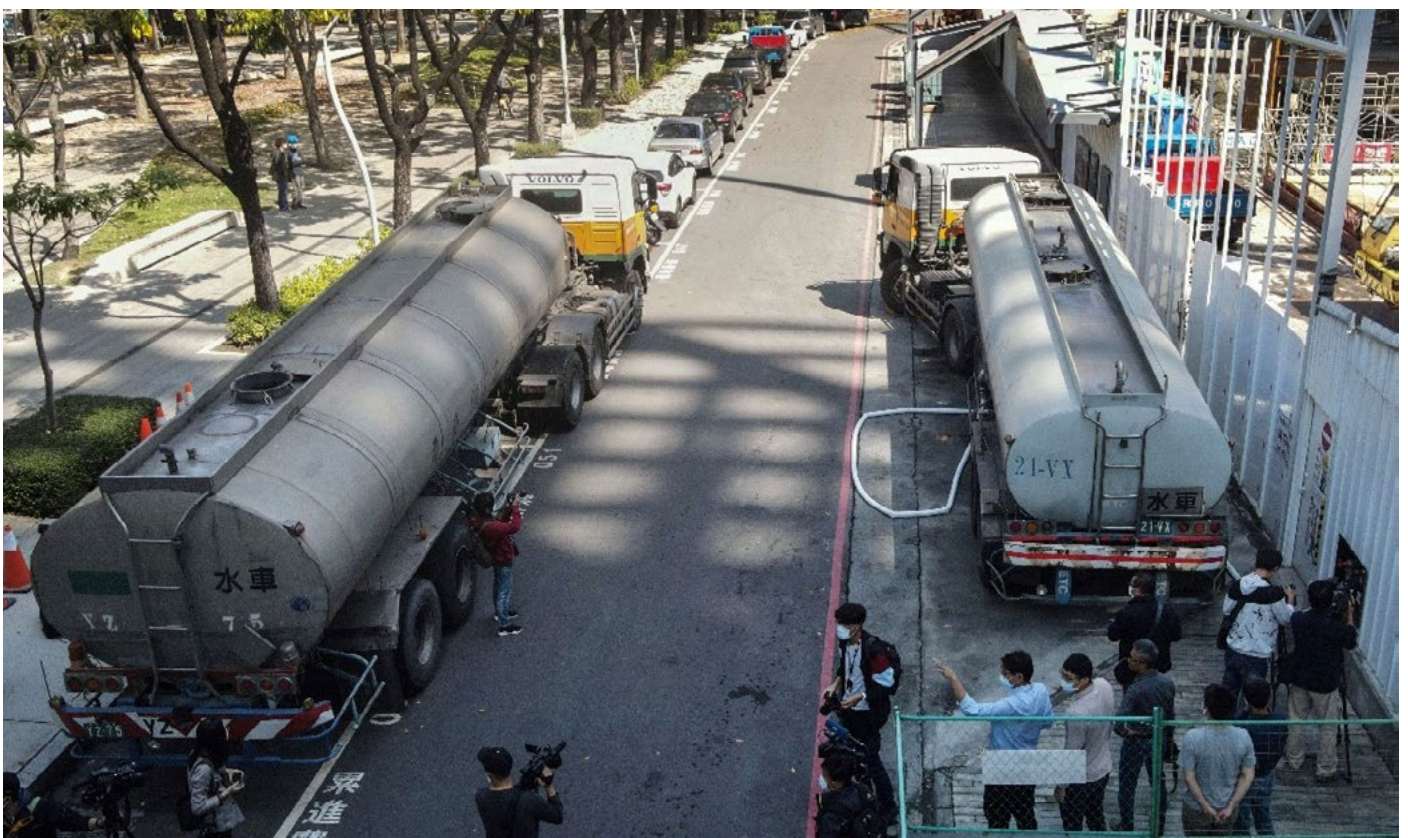
This aerial photo taken on March 25, 2021 shows two water trucks next to a construction site to receive underground water in Taichung, central Taiwan.

Storage of water is another issue related to the island's lack of proper infrastructure (Unabiz, 2021), which results in most (50 billion of the annual 80 to 90 billion m 3 of rainfall) rainwater being lost due to run-off and flowing directly into the ocean (Kaye, 2011; Chang, 2021). Reservoirs, which have been built as the main sources of fresh water, considering the island's mountainous topography, suffer from sedimentation because of steep geographic features and loose soil structure exacerbated by earthquakes, deforestation (Kaye, 2011; Lu and Liu, 2018) and concentrated rainfall, washing the sediments into reservoirs (AIT, 2017; Hale, 2021). Despite cleaning efforts, sediment in the existing reservoirs take up to 30 per cent of the capacity, making it very difficult to keep up with sediment disposal. These high sedimentation rates not only decrease water storage capacity (see section 3.3) but also affect the life expectancy of a reservoir (AIT, 2017), aggravating the island's infrastructural problems.