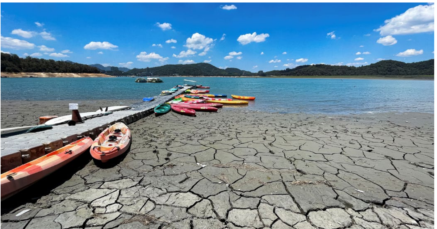
Boats sit at a pier on Sun Moon Lake with low water levels during an island-wide drought, in Nantou, Taiwan May 15, 2021.

Gripped by drought, local authorities shut off irrigation across some 74,000 ha of farmland (around a fifth of the island's irrigated land), heavily impacting the crop yield and livelihoods of farmers (Zhong and Chang, 2021). Irrigation water cuts mainly impacted rice but also affected the production of corn, soybean, buckwheat, forage grass, sweet potatoes, peanuts and leafy vegetables (Reidy, 2021). The shut-off of irrigation especially affected rice harvest on the island. For thousands of years, rice grown in the south and western plains has been a major food staple (Hsing, 2016). As there was no water for rice, which normally needs large amounts of water, rice grains could not mature, thus reducing quality. This meant rice farmers could only sell their harvest for fodder, fetching lower prices than usual (Jensen, 2020). The local authorities offered farmers $500 in compensation per ha of land affected by the irrigation shut-off (Jensen, 2021). Still, farmers fear a long-term loss of livelihoods as the thwarted harvest because of the drought may also encourage customers to seek other suppliers, further depressing the earnings of the farmers (Zhong and Chang, 2021).