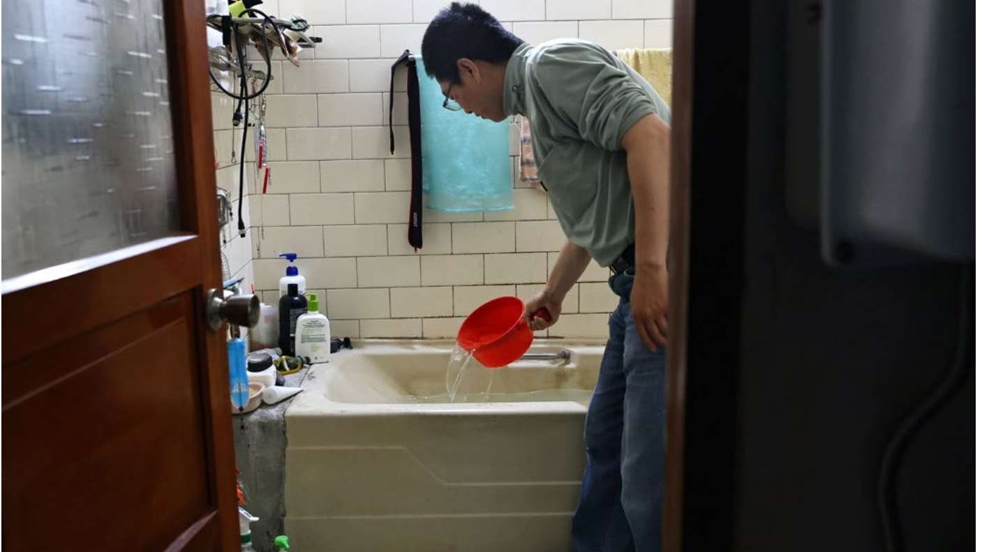
A man scoops water from a bathtub, where he stores water amid water rationing during an island-wide drought, in Hsinchu, Taiwan. March 12, 2021.

Exacerbated by climate change, water shortages will continue to threaten the island. A recent report shows that by the end of the century, the rainfall that feeds reservoirs could diminish by up to 25 per cent in the northern parts and by 50 per cent in the central and southern parts of the island (Barbiroglio, 2021).