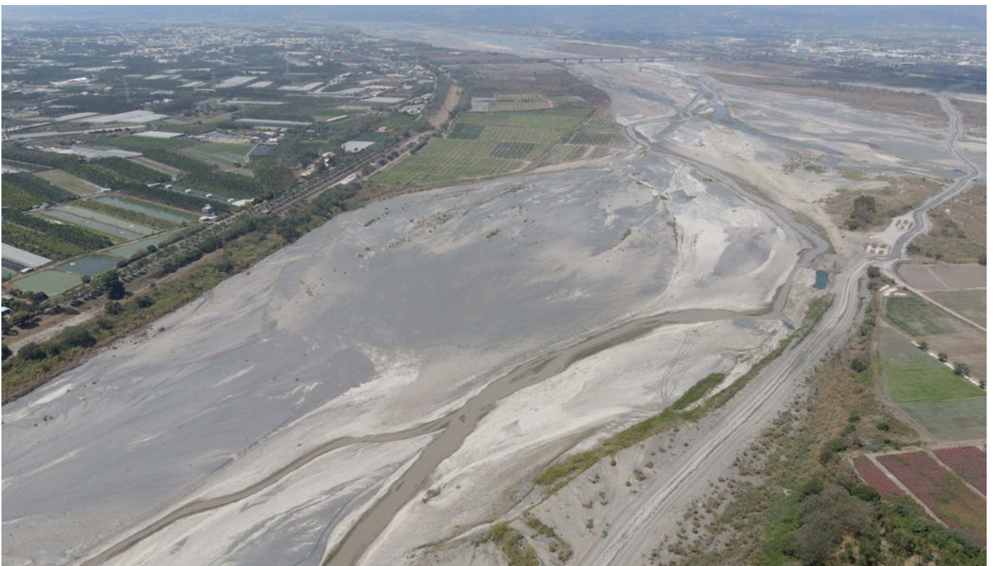
This picture taken on March 16, 2021 shows an aerial view of the dry Ai Liao River bed in Taiwan's Pingtung county.

Taiwan Province of China is one of the wettest places in the world, with an annual rainfall of 2,600 mm, 70 per cent of which is brought to the island by seasonal typhoons (Unabiz, 2021). However, for the first time in 56 years, rain-soaking typhoons failed to make landfall, marking the first half of 2021 as one of the worst drought periods in the island's history (Wang, 2021). With water reservoirs below 5 per cent of their capacity, the local authorities ordered water rationing for more than one million households and businesses. The low levels in the reservoirs also affected the functioning of hydroelectric power plants, forcing outages that impacted both industries and consumers (Berry, 2021).