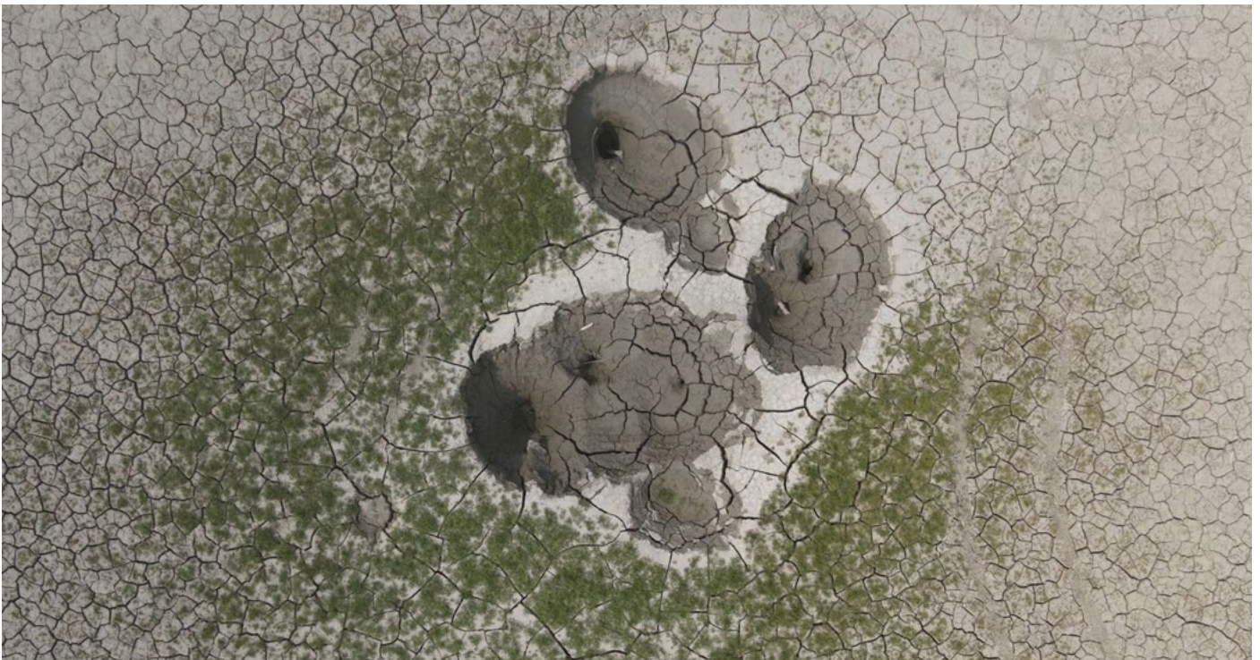
This aerial photo taken on March 17, 2021 shows the Zenwen Dam in Chiayi county, southern Taiwan.

The cheap water prices and little incentive for conscious consumption hide the real costs of water (The News Lens Staff, 2021) and further exacerbate the impacts of droughts, coming at an environmental cost. The pumping of water, for instance, has resulted in land subsidence (Kastner, 2015). Some places in central and southern part of the island, where average precipitation is higher and groundwater withdrawal has historically been high (Liu, 2013), have already sunk below sea level (see section 3.4).