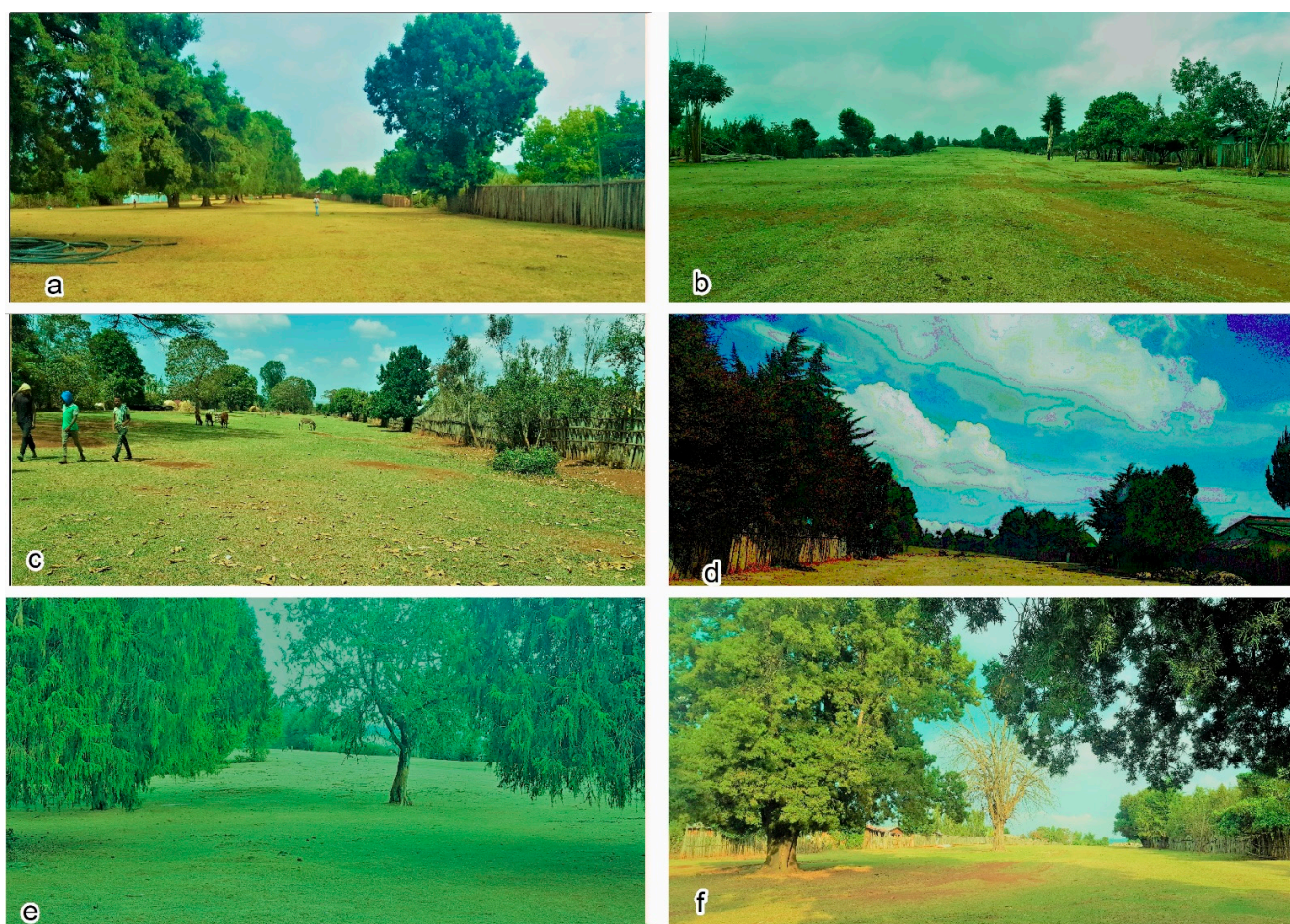
Figure 3. An overview of the selected Jefoure roads sites: (a) Inagera, (b) Selam, (c) Cheret, (d) Aegeera, (e) Yadazer Yezhira, (f) Gehared (field survey, February 2020).