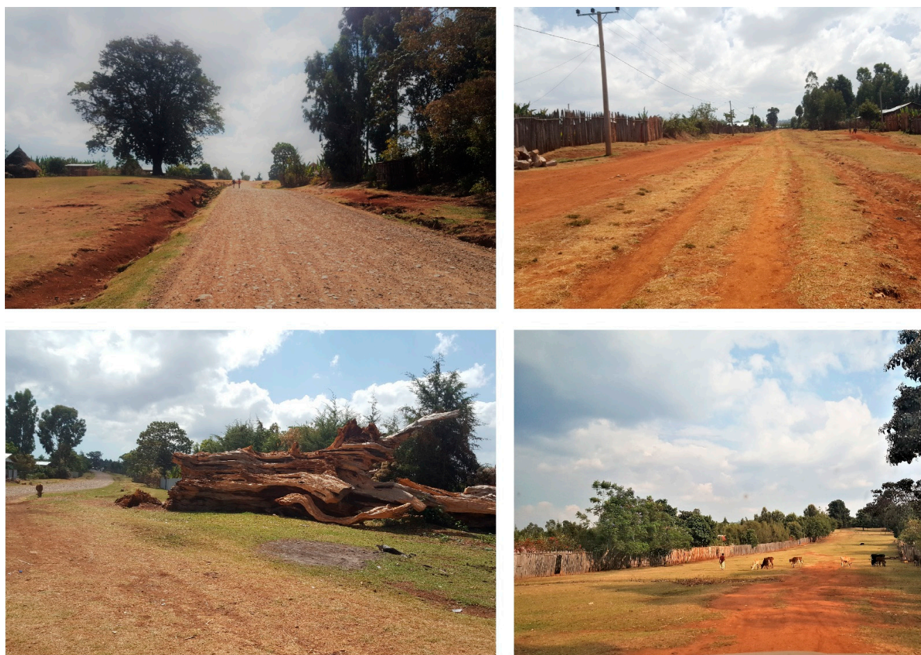
Figure 4. Perceived changes in the landscape mainly by road constructions.

The trend for the past 50 years in the case study shows that the NCP use at different localities has been decreasing (see Table S5). Traditional religious practices have faded in all localities. In villages where conventional roads have been constructed, the contributions, such as local temperature, climate, and water-flow regulation, have been decreasing because of the removal of an important ecology. In such localities, interactions with villages on the opposite side decrease, children cannot play without risks, and the aesthetic quality and scenic beauty of the cultural landscape reduce. There is no change in access to Jefoure roads for humans and livestock or holding Christianity-oriented practices in all localities. The use of Jefoure roads for vehicle transportation has increased in all localities. For a long time, Jefoure roads have served as places to enhance mental and physical health and continue as recreational and ecotourism destinations. Currently, even though only some children and youths play traditional games, such as Zore, Yegenna Chewata, and horse competition, the Jefoure roads still play a significant role in mental and physical health, recreation, and ecotourism.