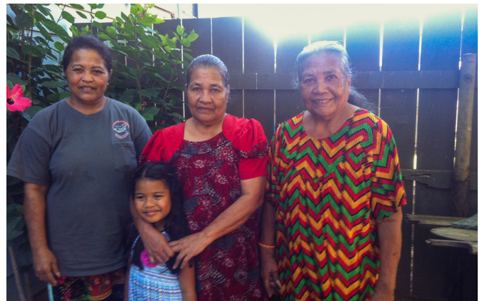
Respondents in Hawai'i