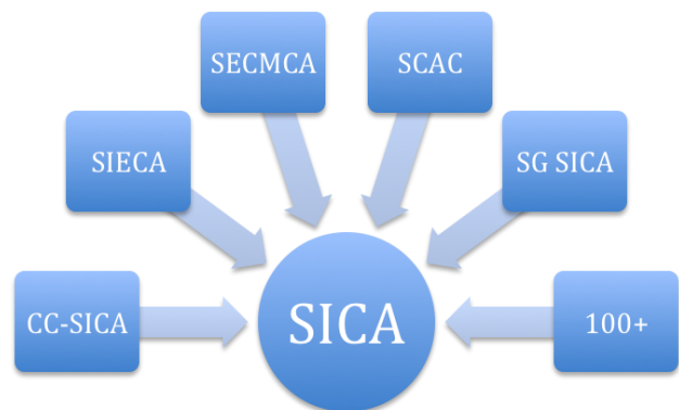
Figure 2 : SICA and other advisory councils and experts

The Central American Parliament (PARLACEN) is by treaty constituted of 20 representatives from each member state, who are directly elected for 5 years. It does not have any legislative powers (yet), and serves mainly as a consultative and advisory body. The judicial arm of the system is represented by the CA court of justice, which is composed of two magistrates originating from each of the states that signed its statute and “guarantees respect for the law in the interpretation and execution of the Protocol of Tegucigalpa with amendments to the Charter of the ODECA and its supplementary instruments or acts pursuant to it” xxx . Finally, the fourth important body of the Central American Regional Integration System is the SICA administration. This organization can be regarded as the (possible) spin-off from deeper regional integration and has the constitutive role to ensure the efficient execution of the decisions adopted in the Meetings of Presidents. Next, the General Secretariat (SG SICA), consists of an executive committee (CE-SICA), a consultative committee (CC-SICA), the Central American Secretariat for Economic