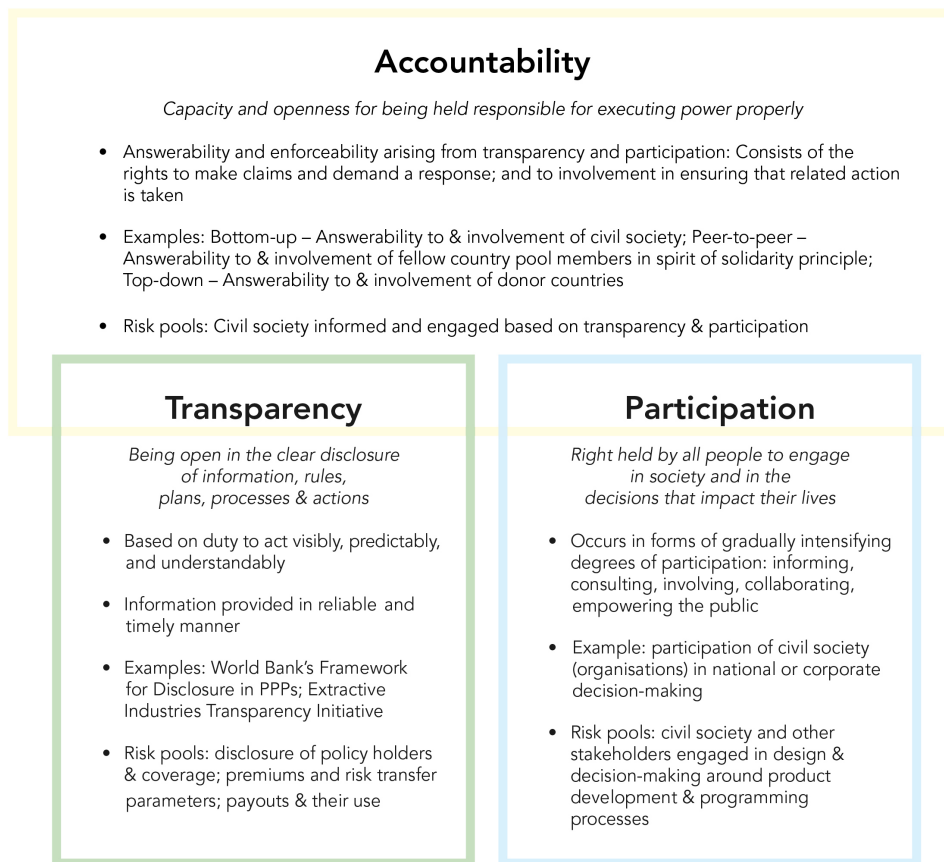
Figure 1: Dimensions of (good) governance: transparency, participation and accountability