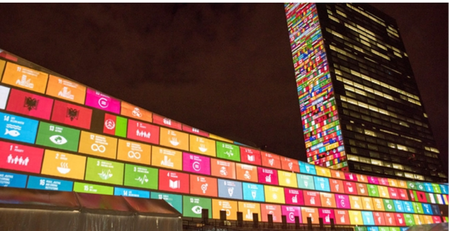
The Sustainable Development Goals projected on UN Headquarters.

The conference also recognized that researchers had a role in identifying pressing challenges which were not yet high on the agenda of the UN system, or member states, but which likely would be so in the foreseeable future. Such research could help the UN and states frame and convene dialogues about issues such as cybersecurity, urbanization, and biotechnology/biosecurity.