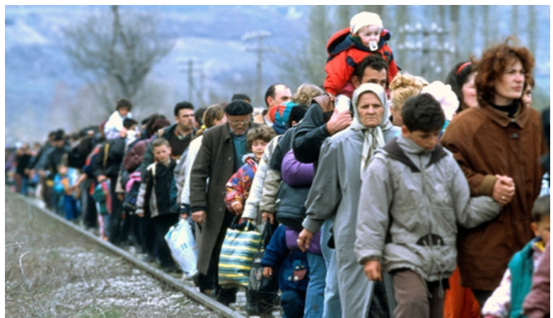
Migrants and refugees in the Balkans.

Migration was highlighted as another area in which policy research has failed to keep pace with the evolution of the challenges. Indeed, in spite of the rise in international migrants and those displaced by conflicts and disasters around the world, which now number 245 million and 65 million, respectively, migration was “understudied and underworked in the UN system.” New research on this topic would need to take into account the global, regional, national and local dimensions of the phenomenon and could, inter alia, offer narratives that could bring to light the positive consequences of migration. Such research should not be done in isolation but also examine the links with other global phenomena such as health, climate change, demographics, and vulnerable groups including youth.