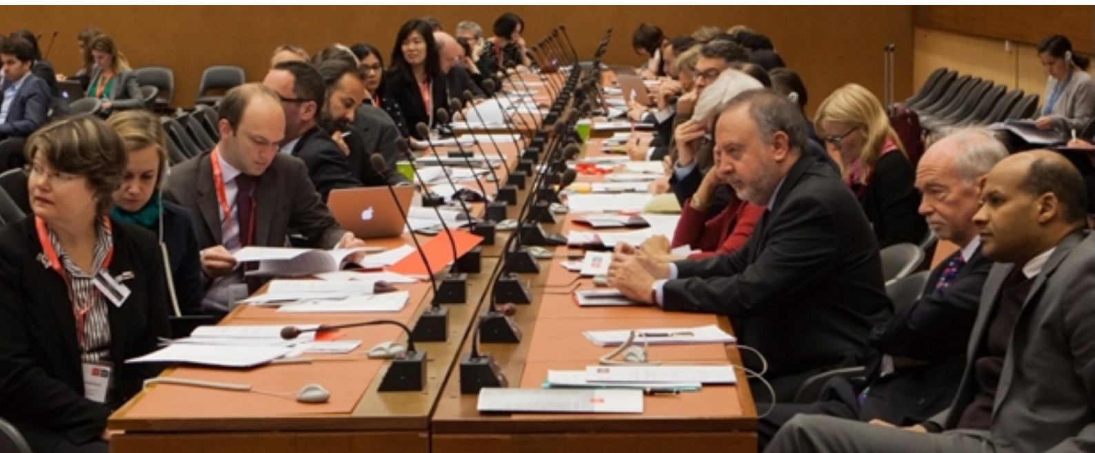
Participants during a plenary session of the “Strengthening the UN’s Research Uptake” conference

Participants also noted that the type of research to be conducted can affect funding decisions. National scientific research funding schemes, for example, do not usually support applied, short-term work which would be more relevant for policy-oriented research required by the UN, but rather favour more systematic, longer-term and academic-orientated projects. For the knowledge community, there are difficulties in obtaining funding for research that challenges, rather than supports, existing policy orthodoxy.