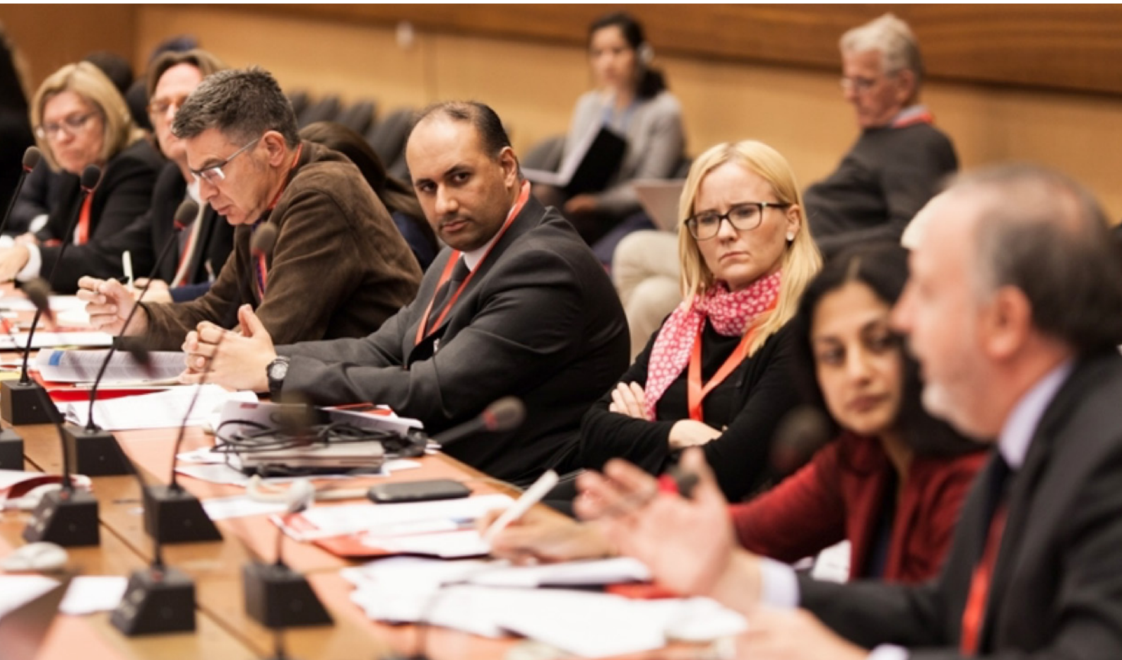
Participants reporting back from their break-out sessions

Participants agreed on the utility of a follow up conference, to foster continued dialogue, and encourage learning across different research domains. A future conference could also bring in experts on research dissemination, to offer practical suggestions on how best to leverage research findings in the policy world, bearing in mind that that “research uptake” should be treated as a serious field of research in its own right.