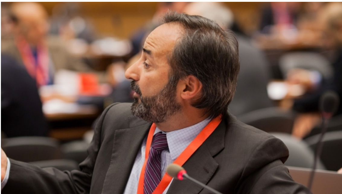
David Haeri, UN Department of Peacekeeping Operations

In the area of development, participants highlighted the need to step up efforts to monitor and evaluate the UN system's development interventions in light of the ambitiousness of the 2030 Agenda, which in turn significantly depends on better availability of data. The conference also highlighted the need for policy researchers to focus on institutional "fitness-for-purpose" questions, and to contribute to policy discussions on how the UN needs to reform the ways in which it is governed, structured, and funded to allow for better implementation of the 2030 Agenda.