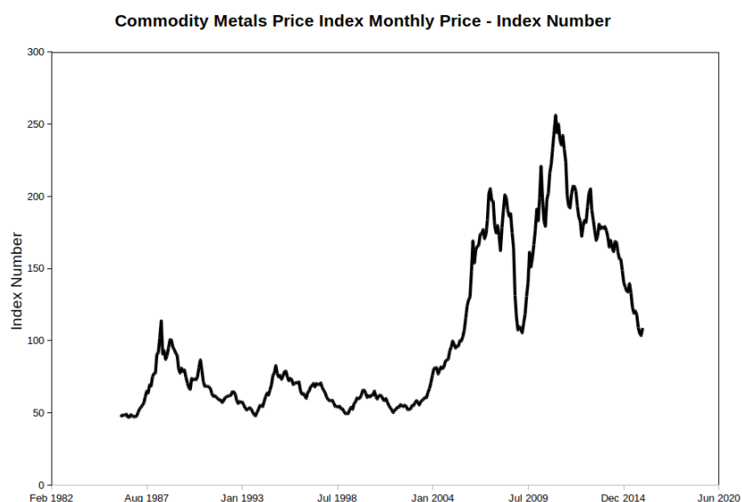
Figure 1: Metal commodities index according to www.indexmundi.org that includes copper, aluminum, iron ore, tin, nickel, zinc, lead, and uranium. (Data from www.indexmundi.org , accessed 13 March 2016)

Historically, banks have already stockpiled and stored minerals, mainly precious metals such as gold. A bank holding gold reserves is also stockpiling a strategic resource. Of course, it is highly unlikely that a bank would store large