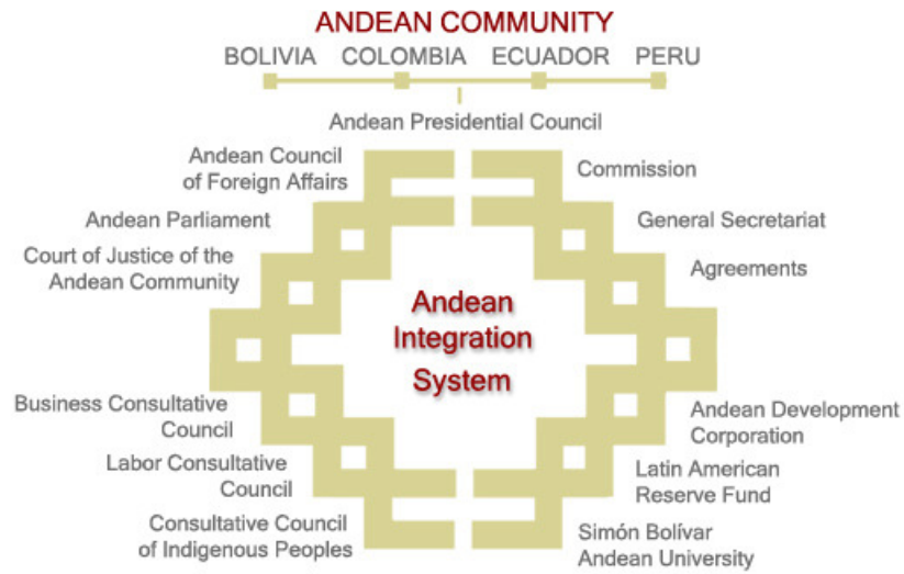
Fig. 1: Institutional Structure of the Andean Integration System (SGCAN n.d.-d).