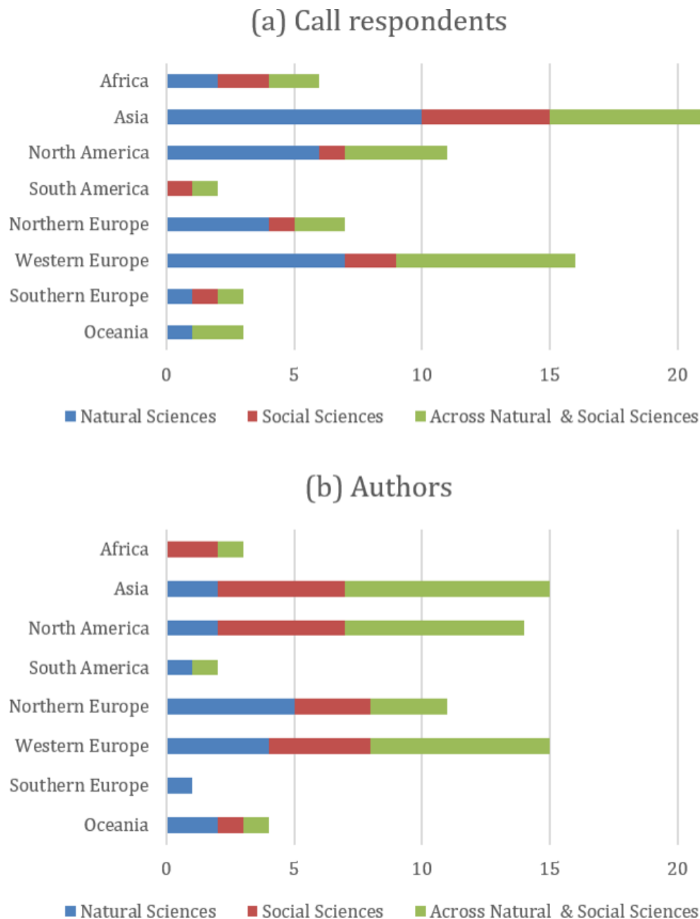
Figure 1. Classification of (a) call respondents and (b) authors (including invited experts, coordinating authors and editorial-board members) in terms of scientific discipline and geography (affiliation based, for details about the geography definitions, see the Supplementary material). Gender composition among call respondents was 30/37/2 (female/male/prefer not to say); among authors it was 33/32/0. The call respondents' classification was made based on their responses; the authors' classification was individually confirmed.

publication dates between January 2021 and July 2022; and (2) individual input from expert and coordinating authors.