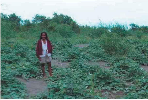
Figure 4. The sandbars become vegetated with a mix of annual crops

The production system has other functions as well. The planted crops protect and provide food for fish fry (alevinos) and newly hatched turtles, species that have become rare due to overfishing and use of pesticides. On average 30% of production from the sand bars is harvested and the rest is consumed by fish and turtles in the following aquatic phase. A diversity of other fish is subsequently attracted to the created habitat, including predatory fish like catfish (bagres), and in this way fishing is made easier. For the ribereños fishing is an important and significant source of income which can then be used for other purchased household needs and especially schooling expenses.