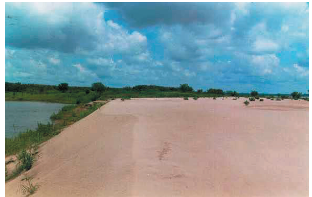
Figure 2. Sand bars are exposed during the low water season

time from planting to harvest. There are varieties that can be harvested in 2, 3 or 4 months. The dos mesinos (two months) varieties are planted on the lowest parts of the sand bars.