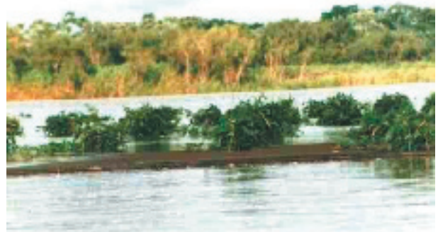
Figure 6 The inundated crops on the sandbar provide food and habitat for fish and turtles