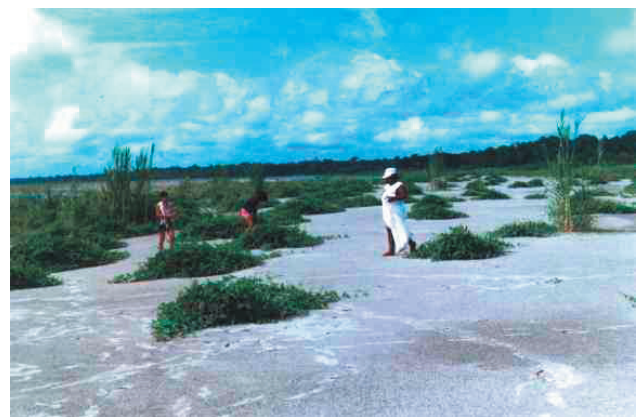
Figure 3. Farmers use the tablone system to plant annual crops