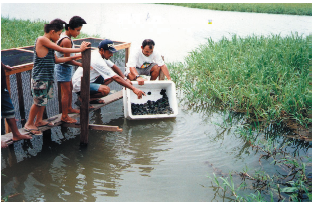
Figure 5. Catching young turtles

The production system has other functions as well. The planted crops protect and provide food for fish fry (alevinos) and newly hatched turtles, species that have become rare due to overfishing and use of pesticides. On average 30% of production from the sand bars is harvested and the rest is consumed by fish and turtles in the following aquatic phase. A diversity of other fish is subsequently attracted to the created habitat, including predatory fish like catfish (bagres), and in this way fishing is made easier. For the ribereños fishing is an important and significant source of income which can then be used for other purchased household needs and especially schooling expenses.