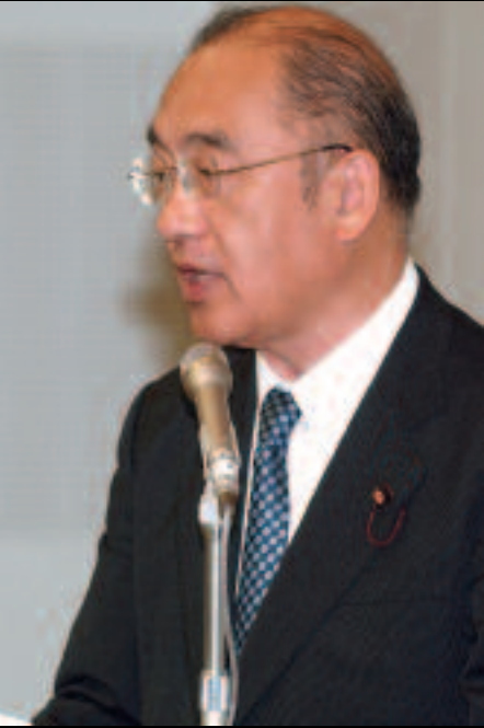
SHOGO ARAI, Parliamentary Secretary for Foreign Affairs