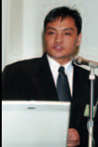
KINLEY WANGDI Government of Bhutan

Intangible heritage is a central element of the cultural heritage of humanity.