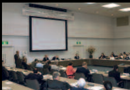
ROUND TABLE DISCUSSION AT UNU