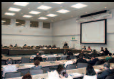
UNITED NATIONS UNIVERSITY, TOKYO