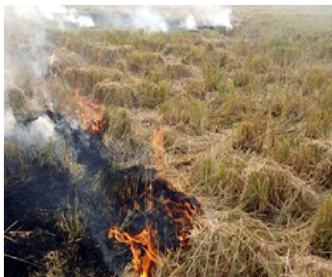
Figure 2: Burning of rice residue.

Varied management practices: The study revealed varying practices in the three major rice production systems in Ghana (irrigated, rainfed upland and lowland system). The mode and quantity of fertiliser application on rice fields varied from one system to the other, and sometimes within the same system. Various flood management strategies are also applied, especially on irrigated and rainfed lowland rice systems. Rice residue/biomass burning was, however, a common practice within all the production systems (see Figure 2). Due to the general lack of measurement of individual potent gases, the contribution of these existing and varied management practices to the emission of potent GHGs remain an unknown. Furthermore, extension officers and farmers were found to have minimal knowledge regarding the linkages between rice management practices, emission of potent GHGs and contribution to climate change.