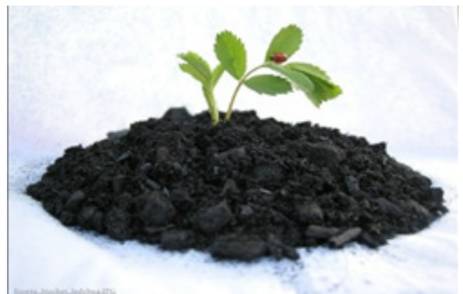
Figure 3. Top: biochar production. Bottom: example biochar product

Incentives: Future policy reviews should consider including incentives for rice and other types of farmer to adopt climate-smart practices that increase production and concurrently reduce emission of potent GHGs. A review of two relevant agricultural sector policies – National Climate Smart Agriculture and Food Security Action Plan and METASIP – revealed no provision of incentives for farmers adopting GHG-sensitive practices. The Ghana Strategic Investment Framework (GSIF) for Sustainable Land Management (SLM), which is designed to create incentives for adoption and upscaling of SLM practices, does not provide any incentives for farmers who adopt environmentally safe practices in cultivation. Policy revisions should advocate incentives such as the payment of premium prices for rice cultivated using recommended soil, water and residue management practices. At the same time, customers should be educated and encouraged to patronize such produce. Schemes similar to REDD+ (Reducing Emissions from Deforestation and Forest Degradation) could be designed for rice and other crop farmers to gain credit for adopting recommended management policies. Ghana's mitigation targets in the AFOLU (Agriculture, Forestry and Other Land Uses) sector can only be achieved if enough incentives exist for farmers to adopt GHG-sensitive management practices.