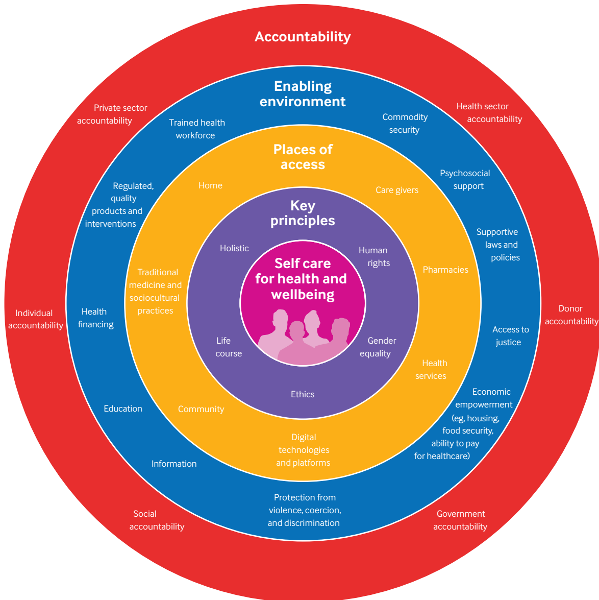
Fig 3 | Framework for self care interventions

self care—for example, in providing care to dependents, including differently abled, newborn, or young children; seeking medical assistance, including going to a health centre, counselling, and treatment; or for confirmatory testing (such as for a positive HPV test result). 25