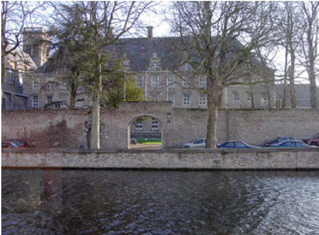
UNU-CRIS new premises in the historical building of Grootseminarie, Potterierei 72, Bruges.