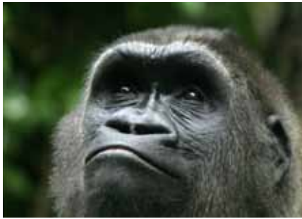
Figure 6 A Gorilla sanctuary has been in place in Cameroon/Gabon borders to ensure its protection, with high priority to the participation of local communities for the improvement of their livelihood through ITTO project "Establishment of the Mengamé-Minkébé Transboundary Gorilla Sanctuary (MMGS) at the Cameroon-Gabon Border"