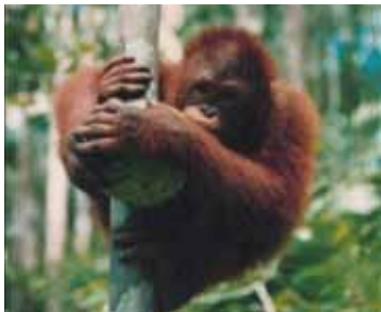
Figure 2 Orangutan western Borneo subspecies ( Pongo pygmaeus pygmaeus ) in Lanjak Entimau Wildlife Sanctuary in Sarawak, Malaysia/Betung Kerihun National Park in Indonesia. Population: 4,000. Transboundary cooperation helps secure large conservation forests. Development of Lanjak-Entimau Wildlife Sanctuary as a totally protected area has been supported by ITTO projects since 1994.