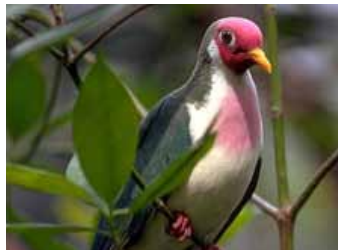
Jambu fruit dove