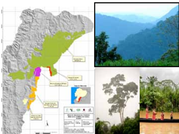
Figure 8 Management of the Transboundary Natural Protected Areas between Ecuador and Peru, such as the El Cóndor Protected Forest, the Biological Reserve El Quimi and the Wildlife Refuge El Zarza has been enhanced through the development of a binational conservation framework under ITTO project "Bi-national conservation and peace in the Condor Range region, Ecuador-Peru (Ecuadorian component)"