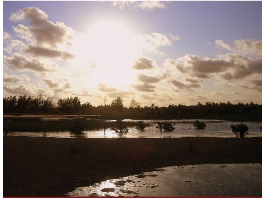
Flooding can mean land is no longer a feasible habitat (EACHFOR®)

It is crucial that we build a strong scientific base for discussion of this topic.