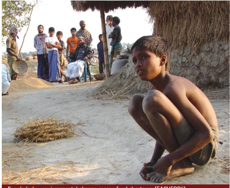
Bangladesh - environmental change means food shortages (EACHFOR®)

This means accurately identifying and characterising environmental migrants, which will have the knock-on effect of increasing awareness, as knowledge about environmental degradation and climate change can arm governments, migrants, and potential migrants against human security crises. Of course this will pose a number of administrative